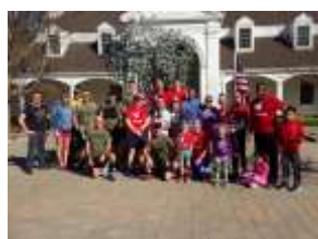
Walk, run, or ruck!