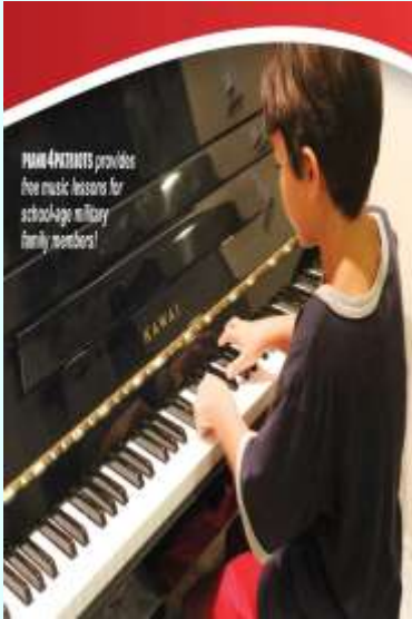
Piano4Patriots provides free music lessons for school age military family members